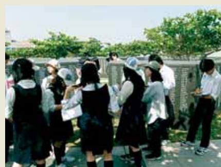
Grade 3 School Excursion