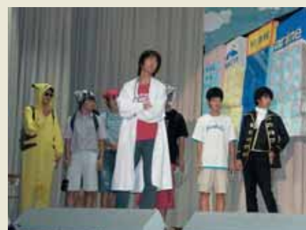
Play in School Festival