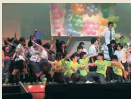
Dance in School Festival