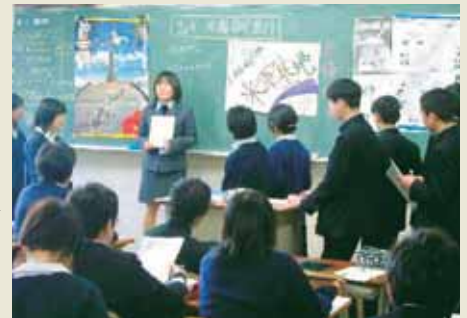
Preliminary Study about → OKINAWA (3rd-grade school excursion)