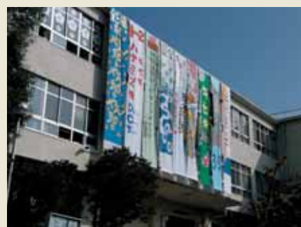
School Festival Displays