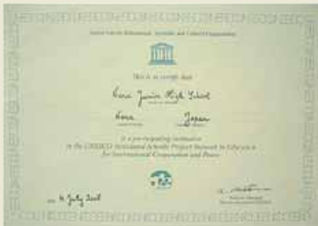
← a certificate of UNESCO ASP Network in Education