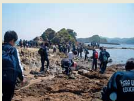
Grade 2 School Excursion