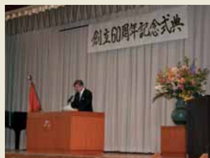
Ceremony Marking the 60th Anniversary of the Foundation